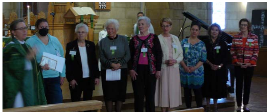
Landscape Legacy Celebration October 16, 2022